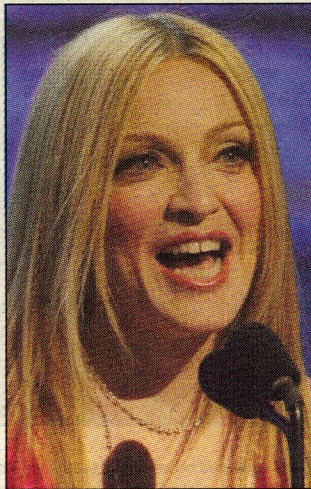
Madonna . . . planted a tree at Skibo

Skibo has also hosted prestigious events like the Northern Open Golf Tournament, which attracts thousands of enthusiasts to the area.