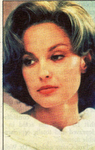
Ashley Judd . . . married at the castle