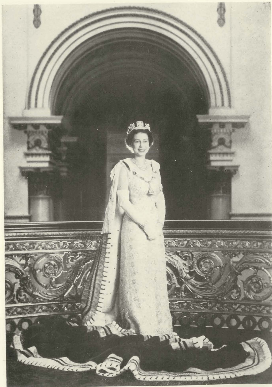
Her Majesty Queen Elizabeth, Patron, The British Legion Scotland.