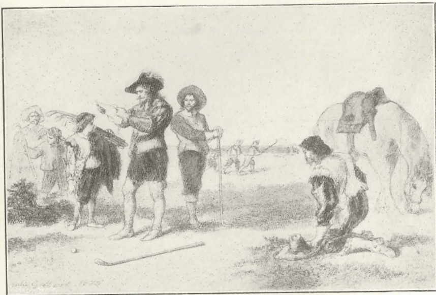
Charles I. (who erected Dornoch into a Free Royal Burgh in 1628) while playing Golf on Leith Links, receives news of the breaking out of the Irish Rebellion