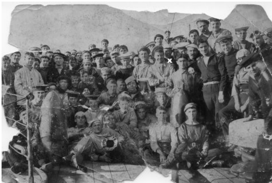
2011_014_07 Group of sailors