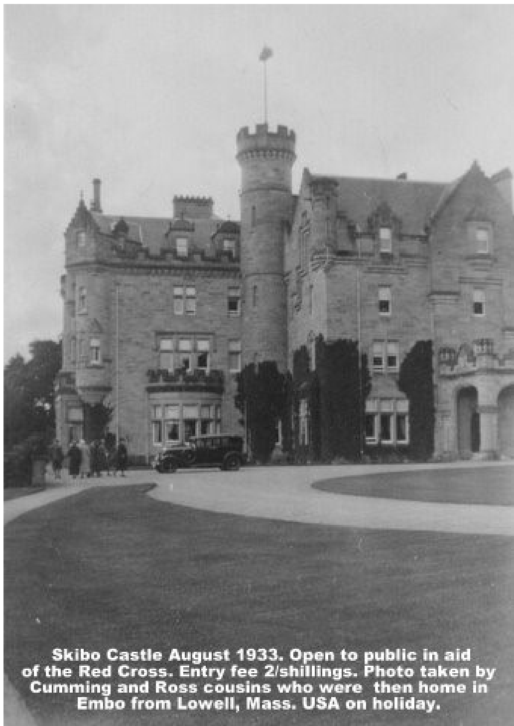
Skibo Castle August 1933. Open to public in aid of the Red Cross. Entry fee 2/shillings.