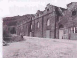
Foyers Aluminium Works