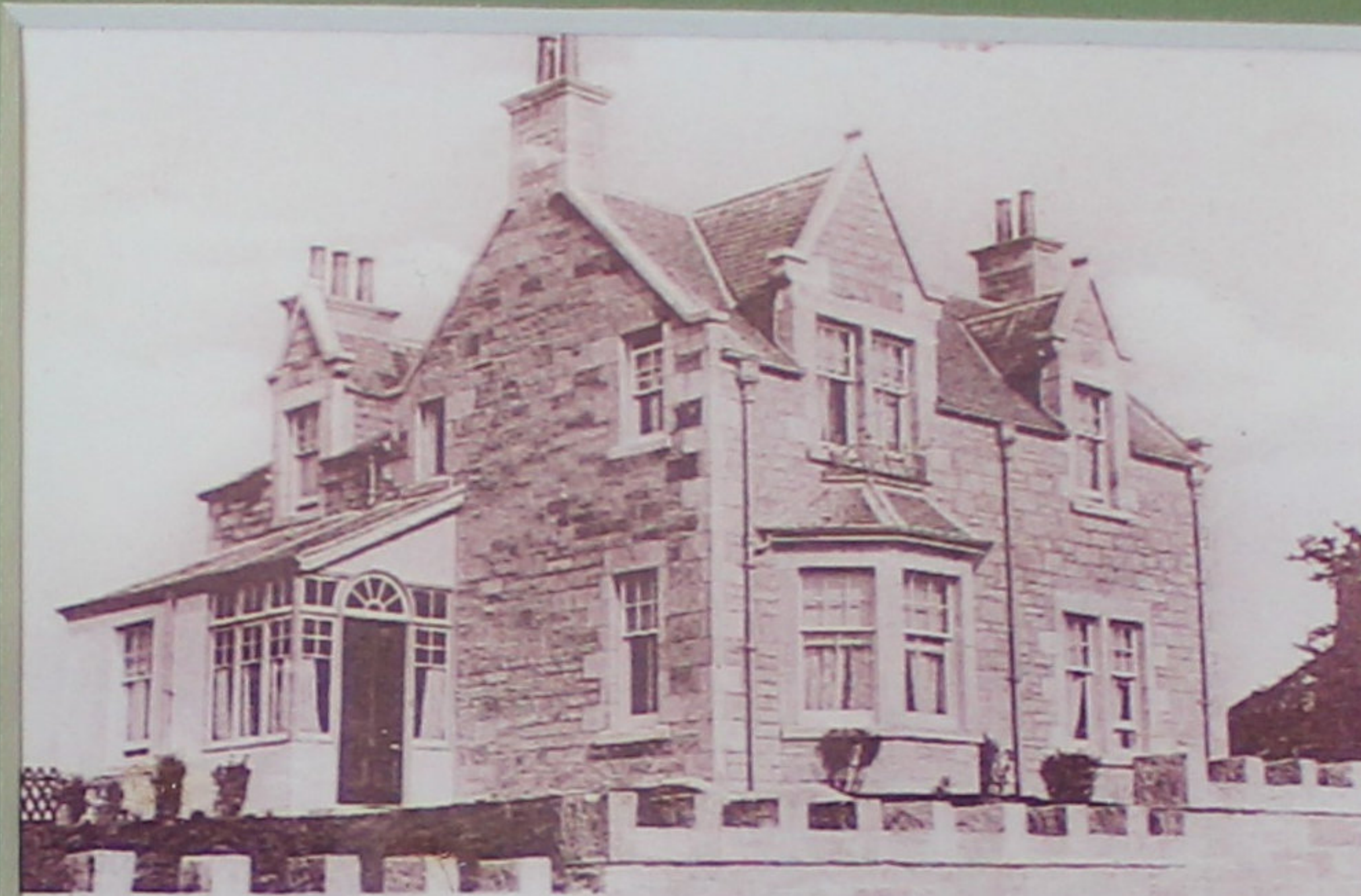
United Free Manse, Dornoch