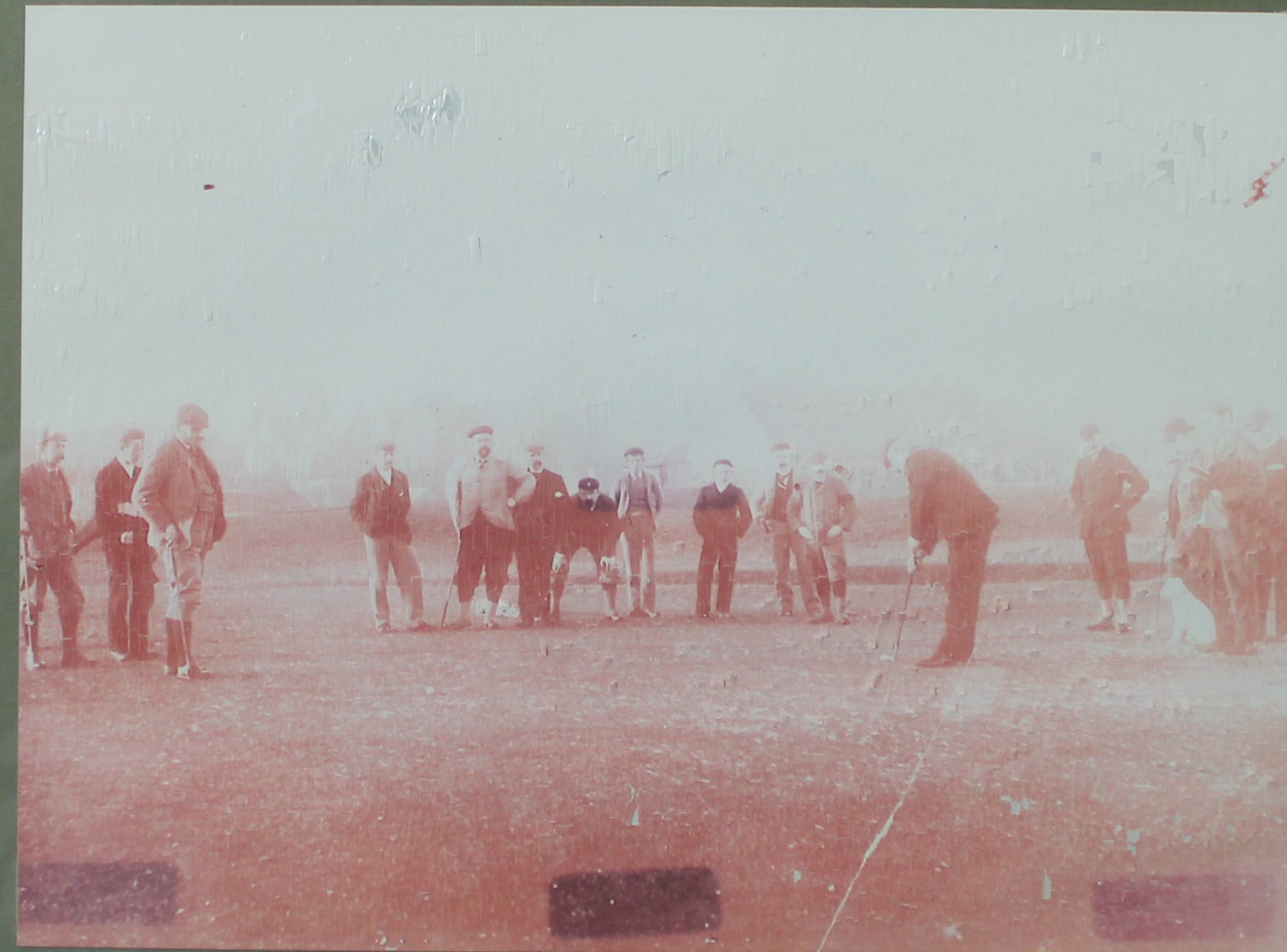
CHEIF CONSTABLE JOHN MAC DONALD