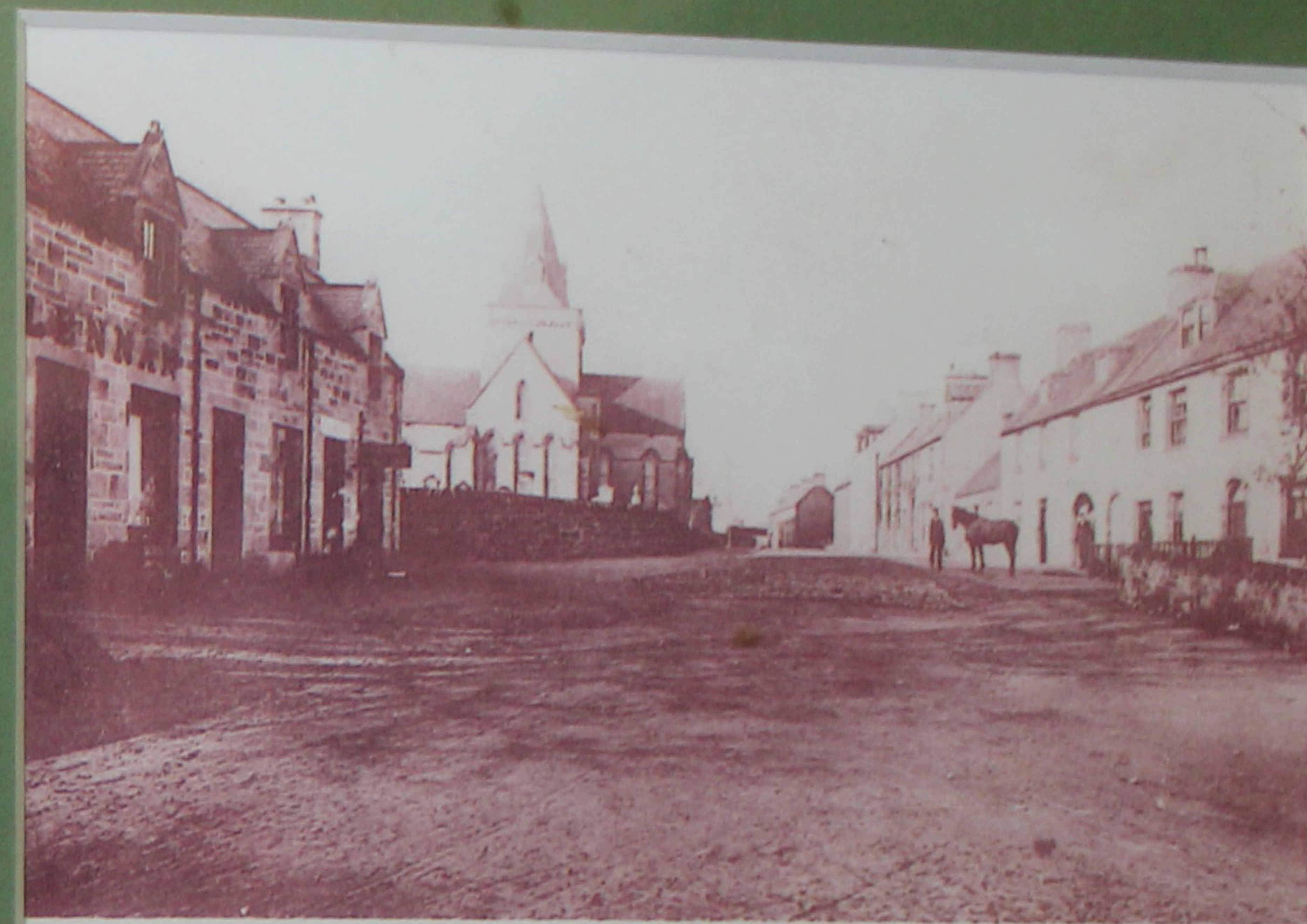
High Street, Dornoch