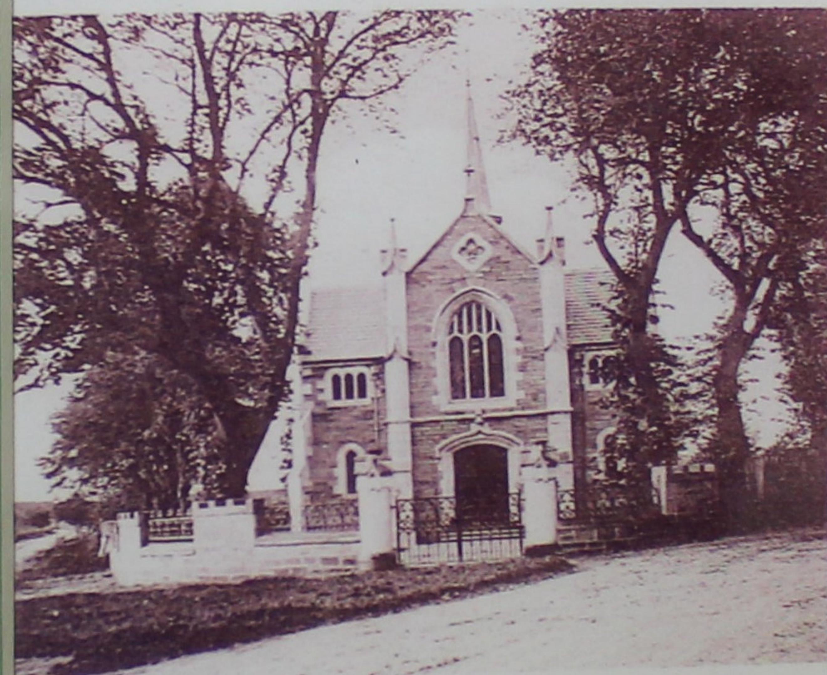
United Free Church, Dornoch