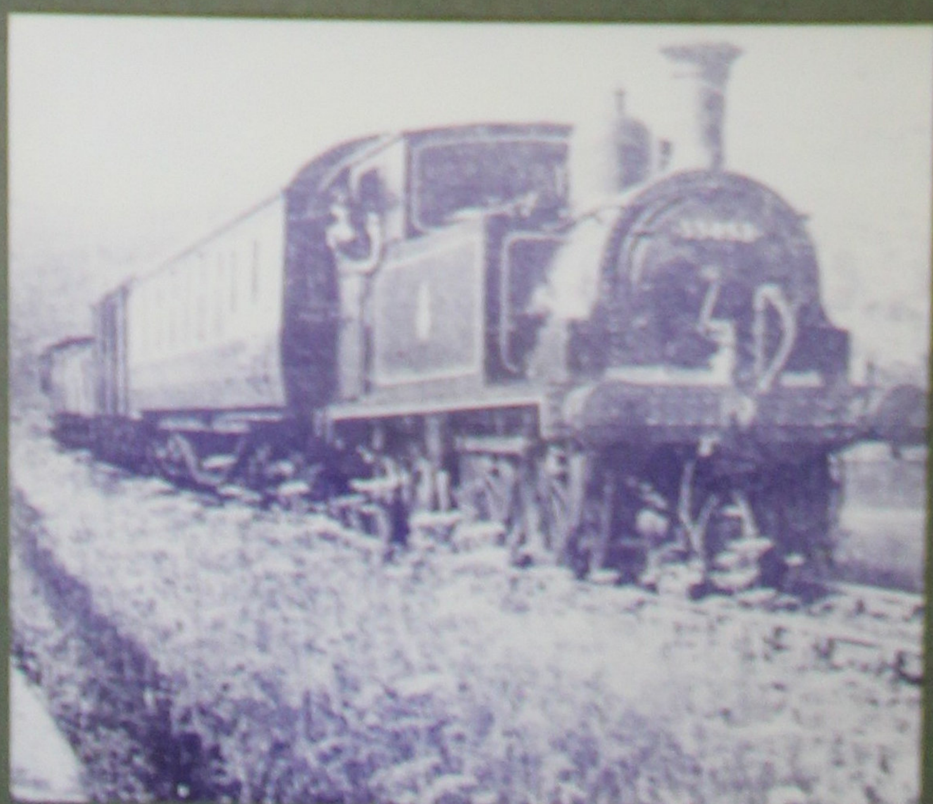
"THE COFFEE POT"