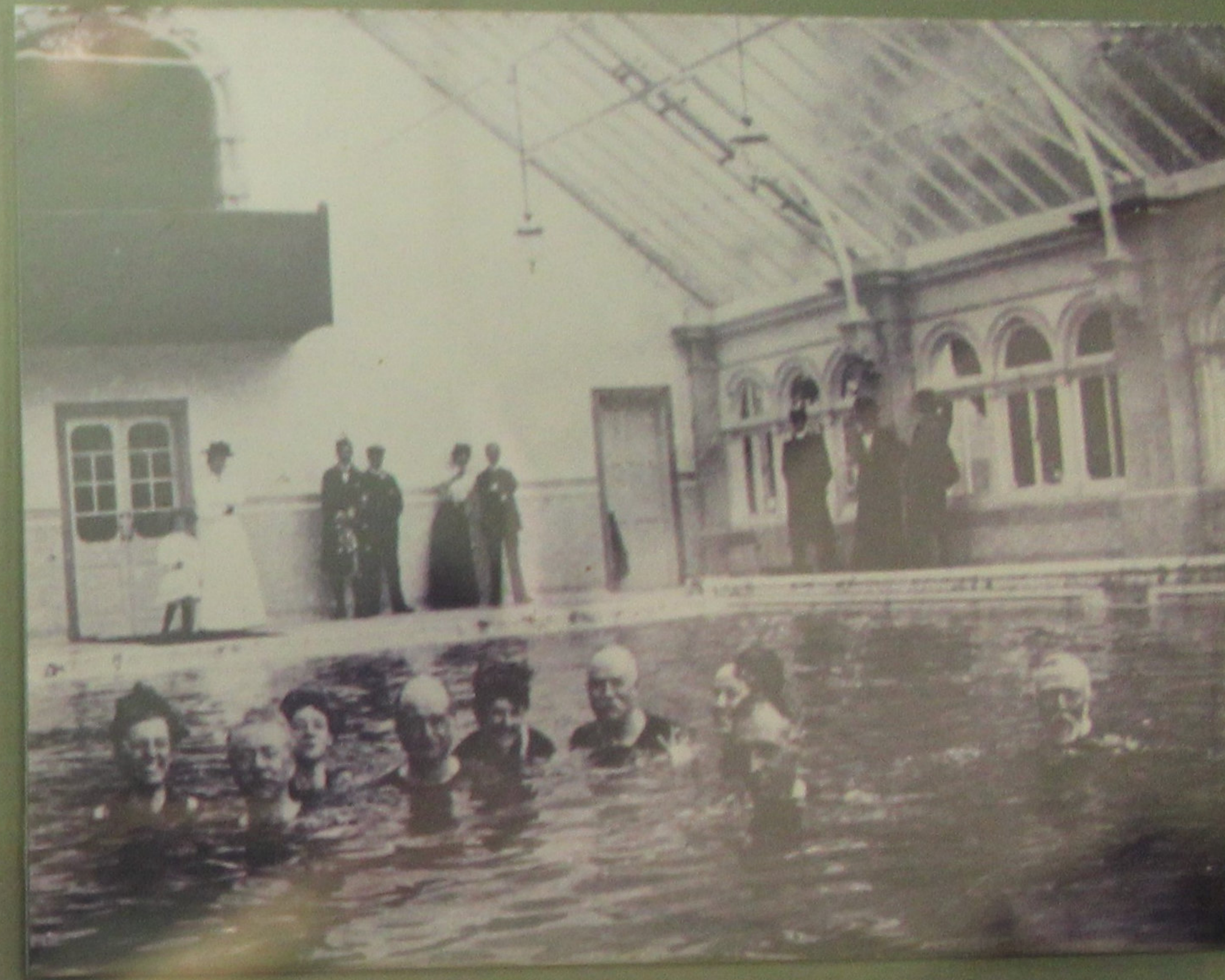
ANDREW CARNEGIE IN THE POOL