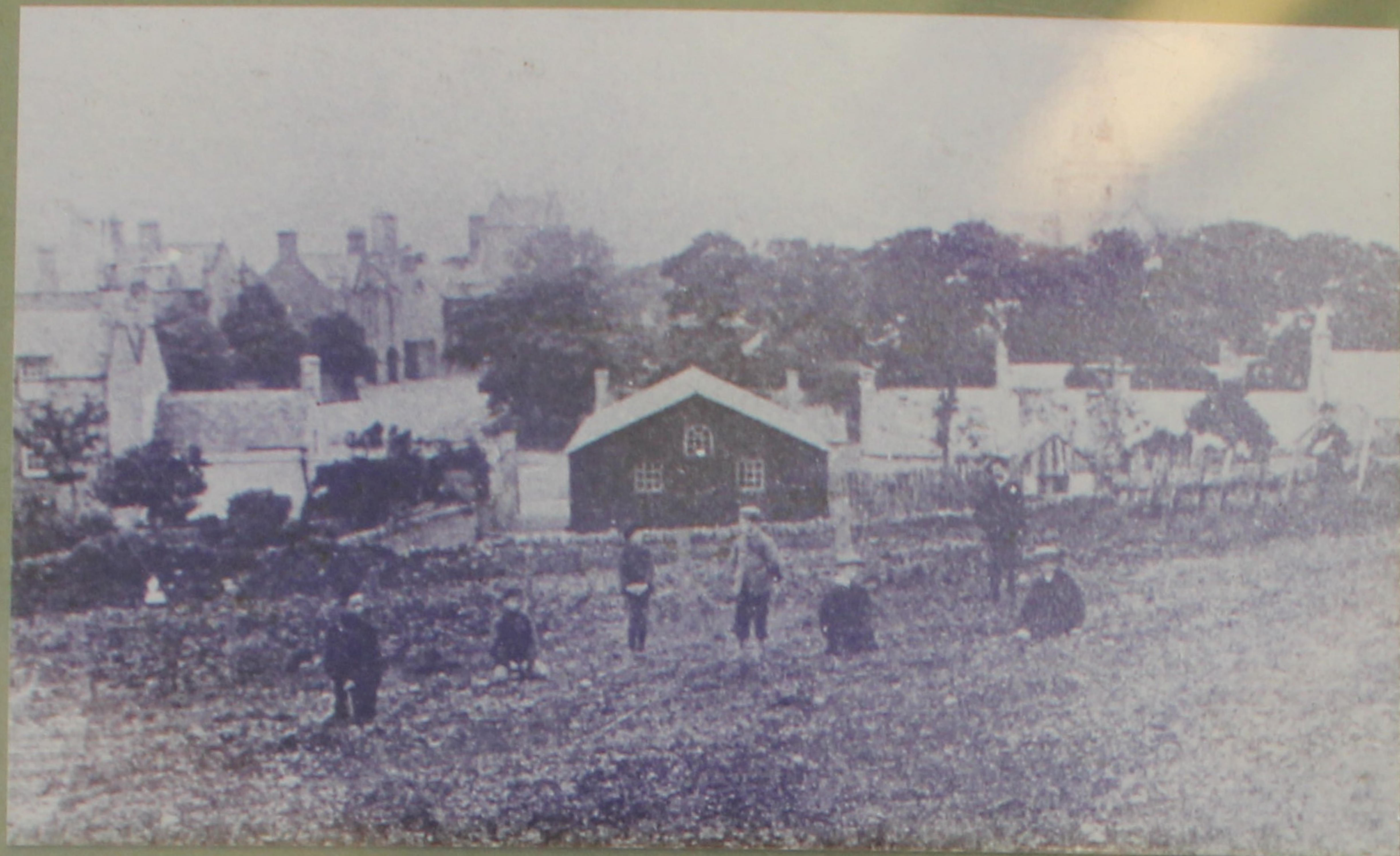
THE BLACK HALL