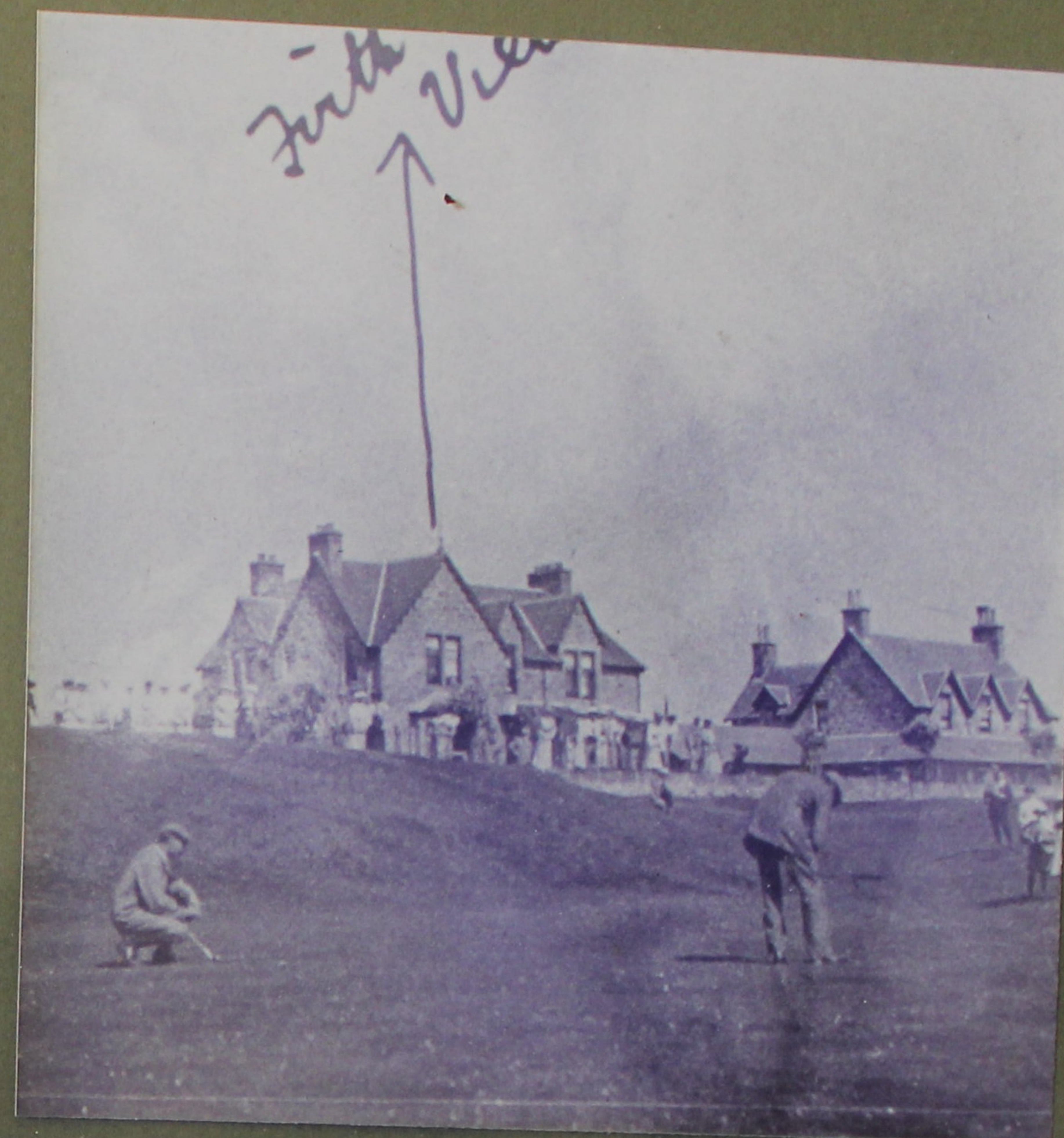
PUTTING 1 ST GREEN