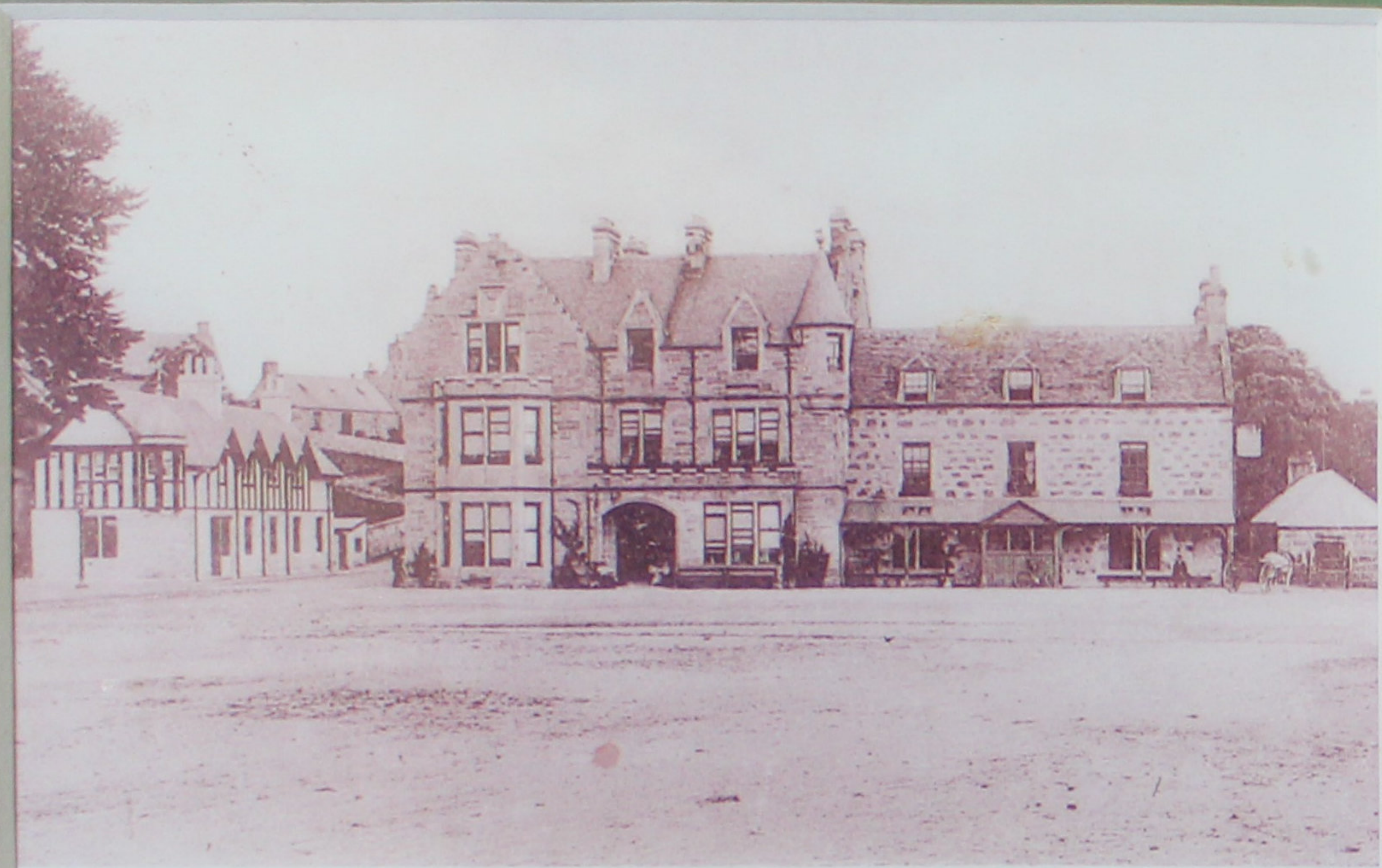
SUTHERLAND ARMS HOTEL — DORNOCH