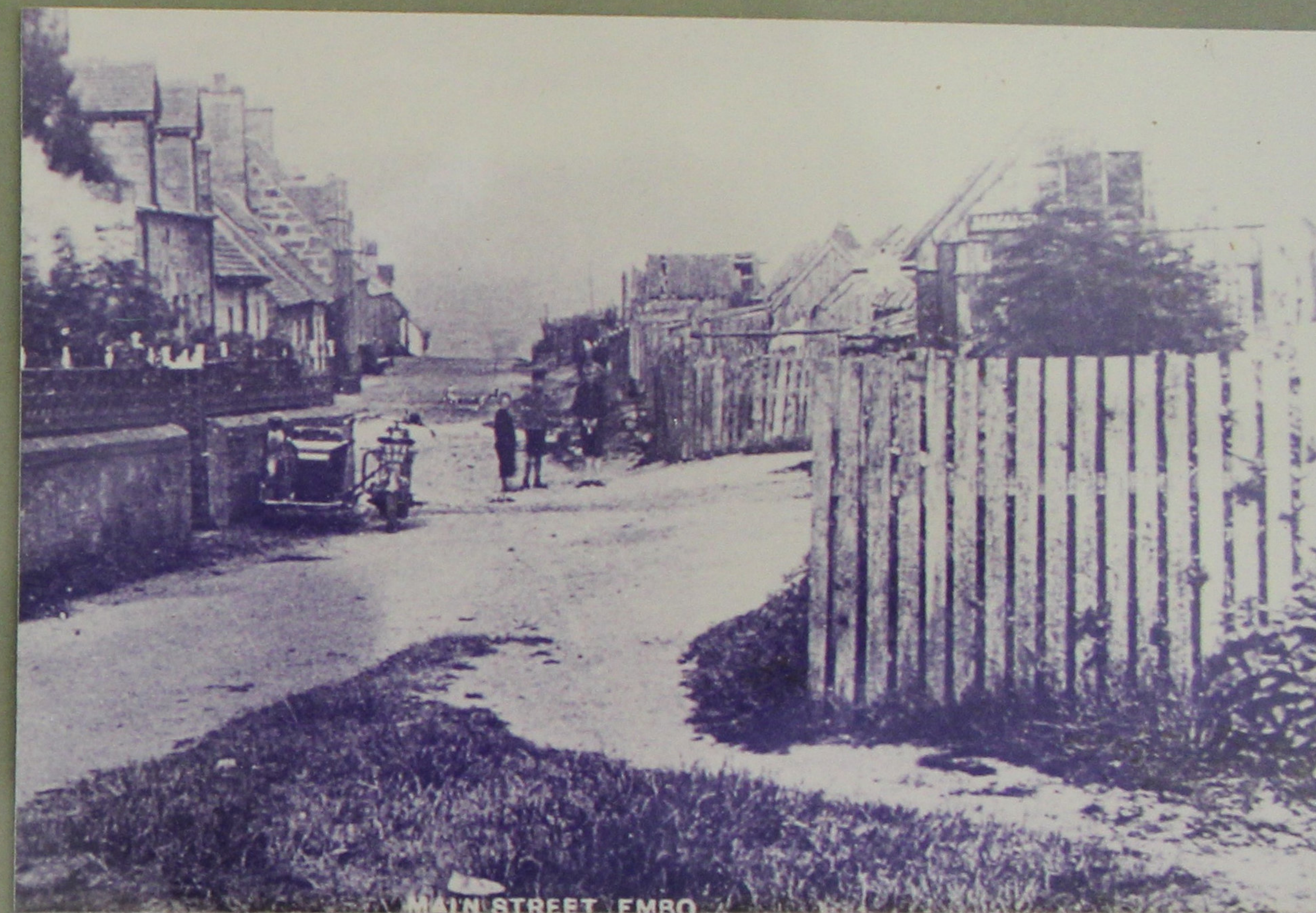
MAIN STREET EMBO