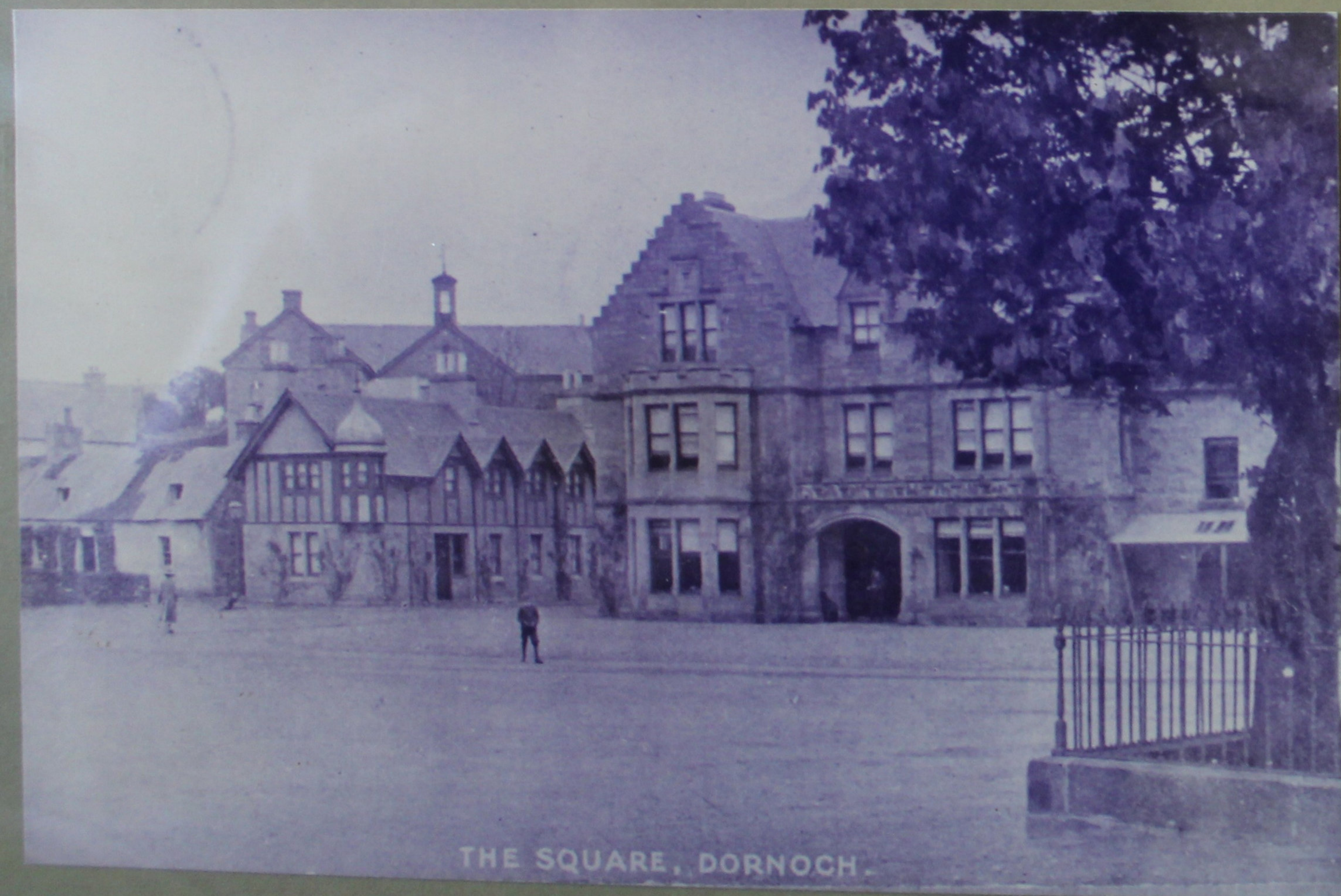
THE SQUARE, DORNOCH