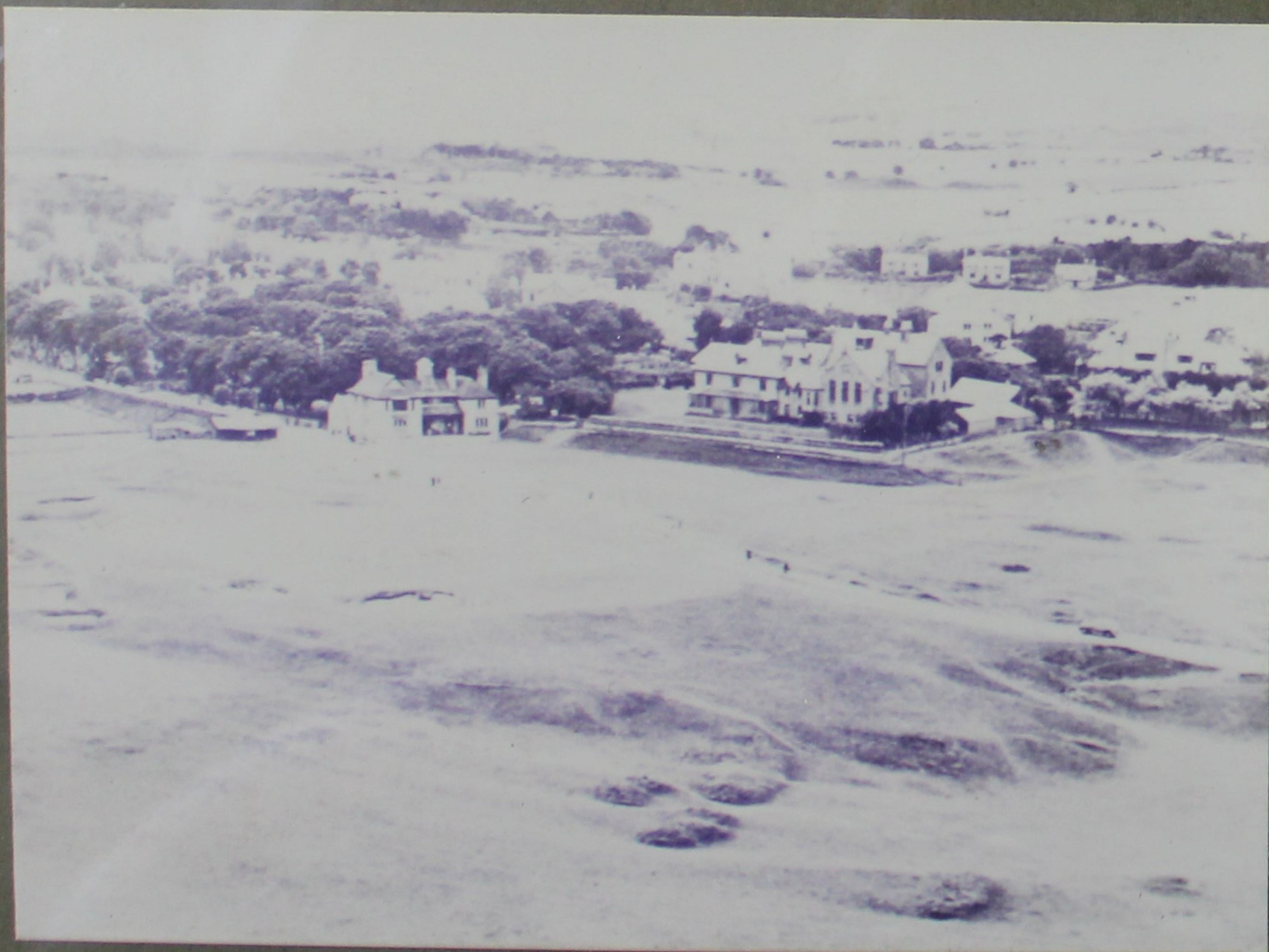
OLD 18 TH GREEN