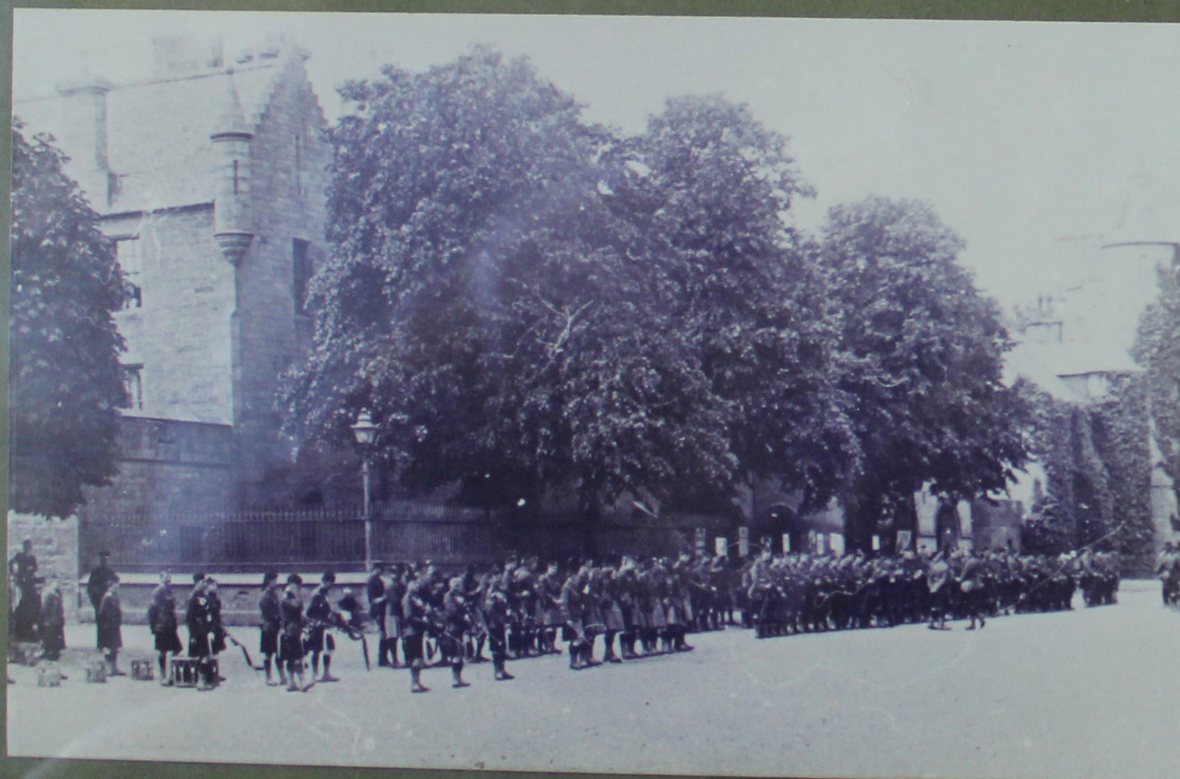
GORDONS HIGHLANDERS DURING 1 ST WORLD WAR