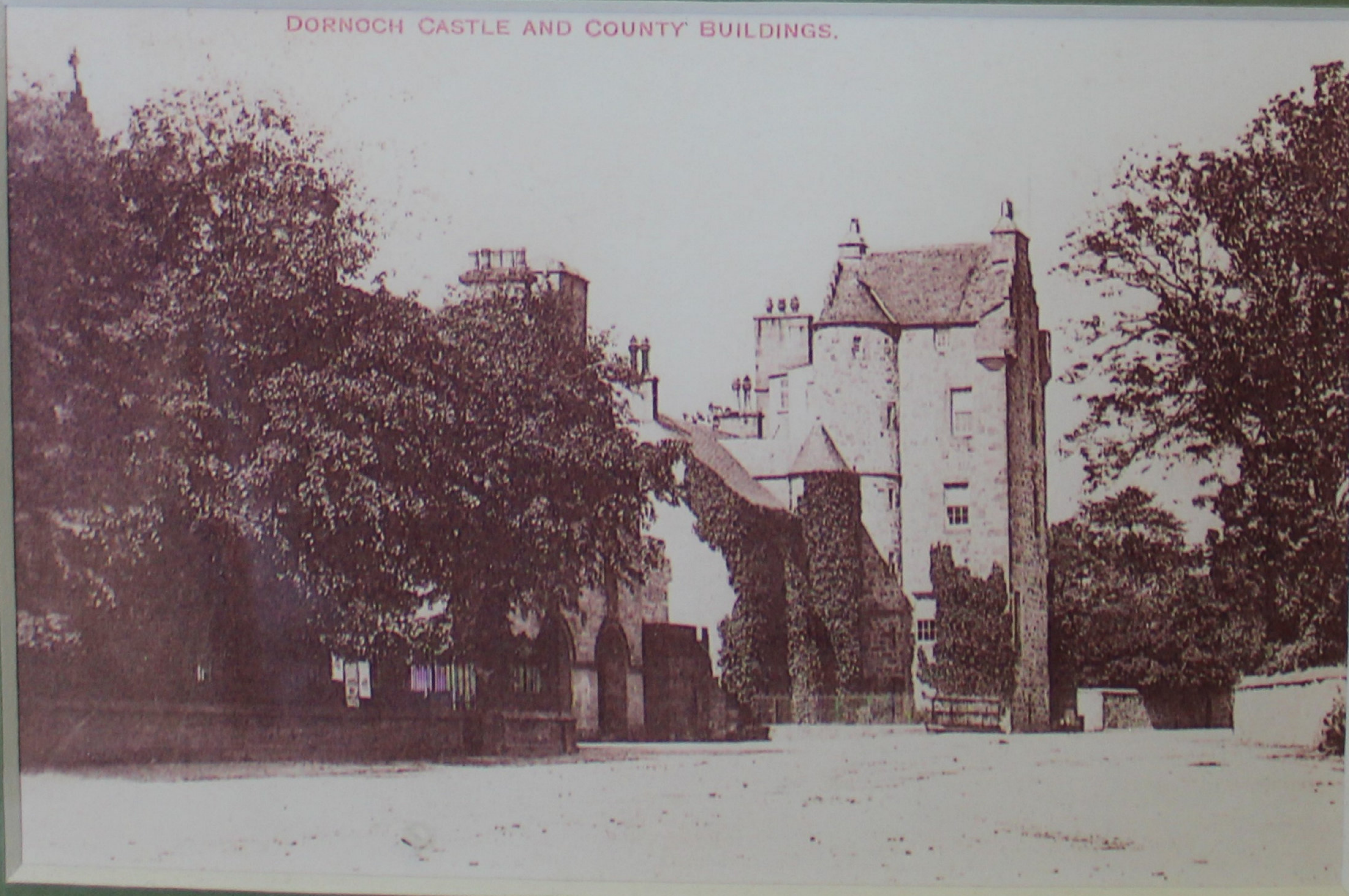
DORNOCH CASTLE AND COUNTY BUILDINGS.