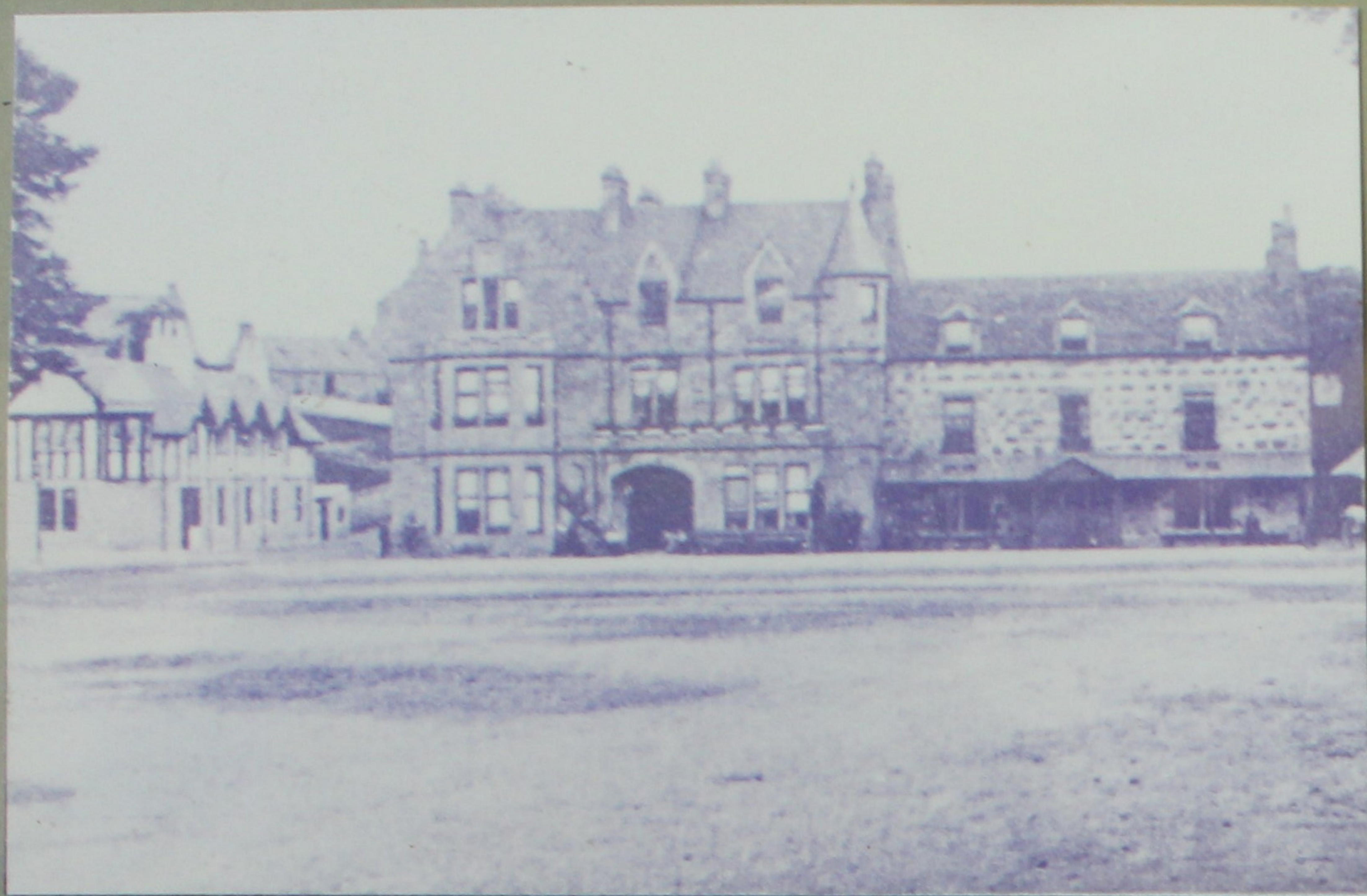
SUTHERLAND ARMS HOTEL & ANNEXE