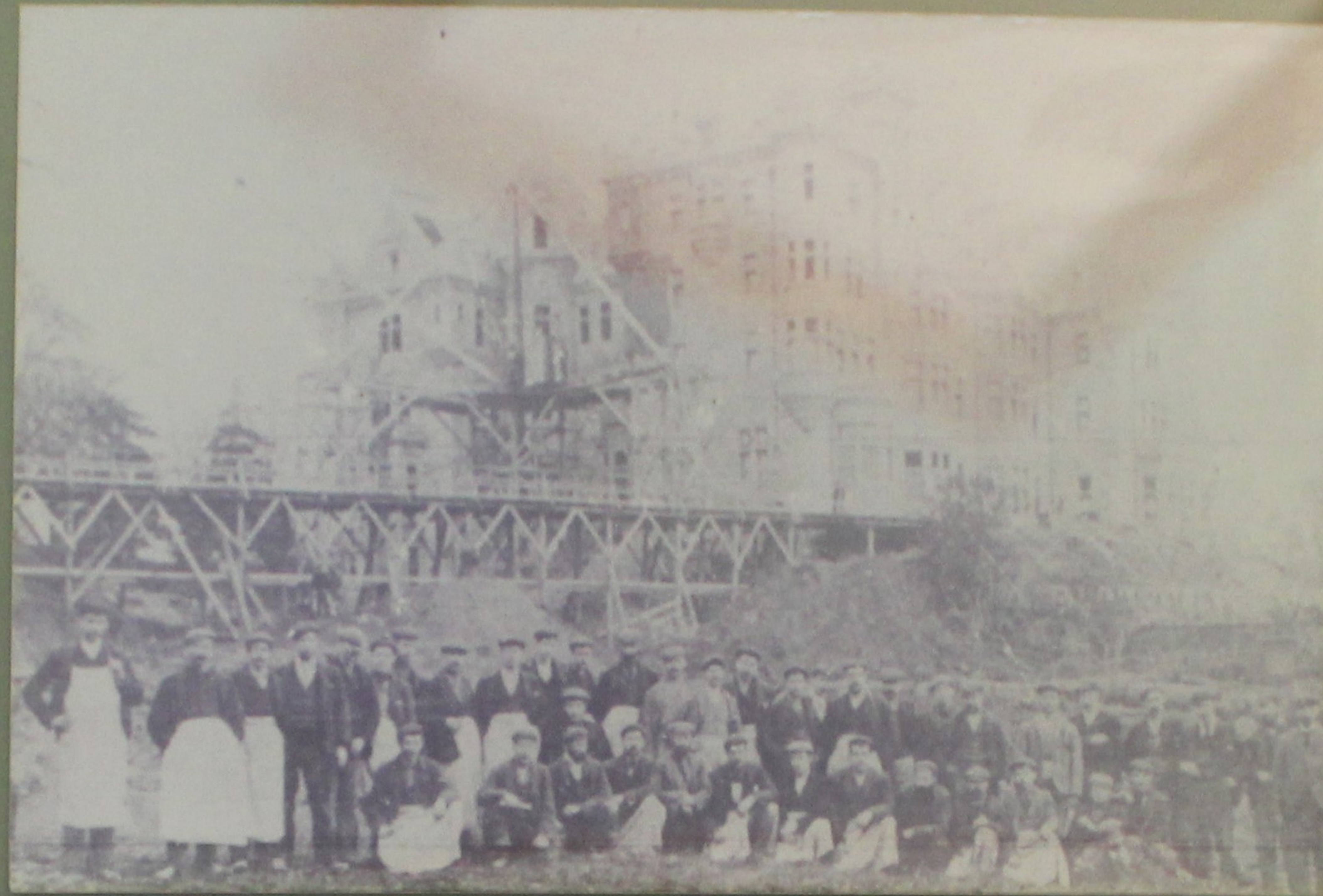
RECONSTRUCTION OF SKIBO CIRCA 1900