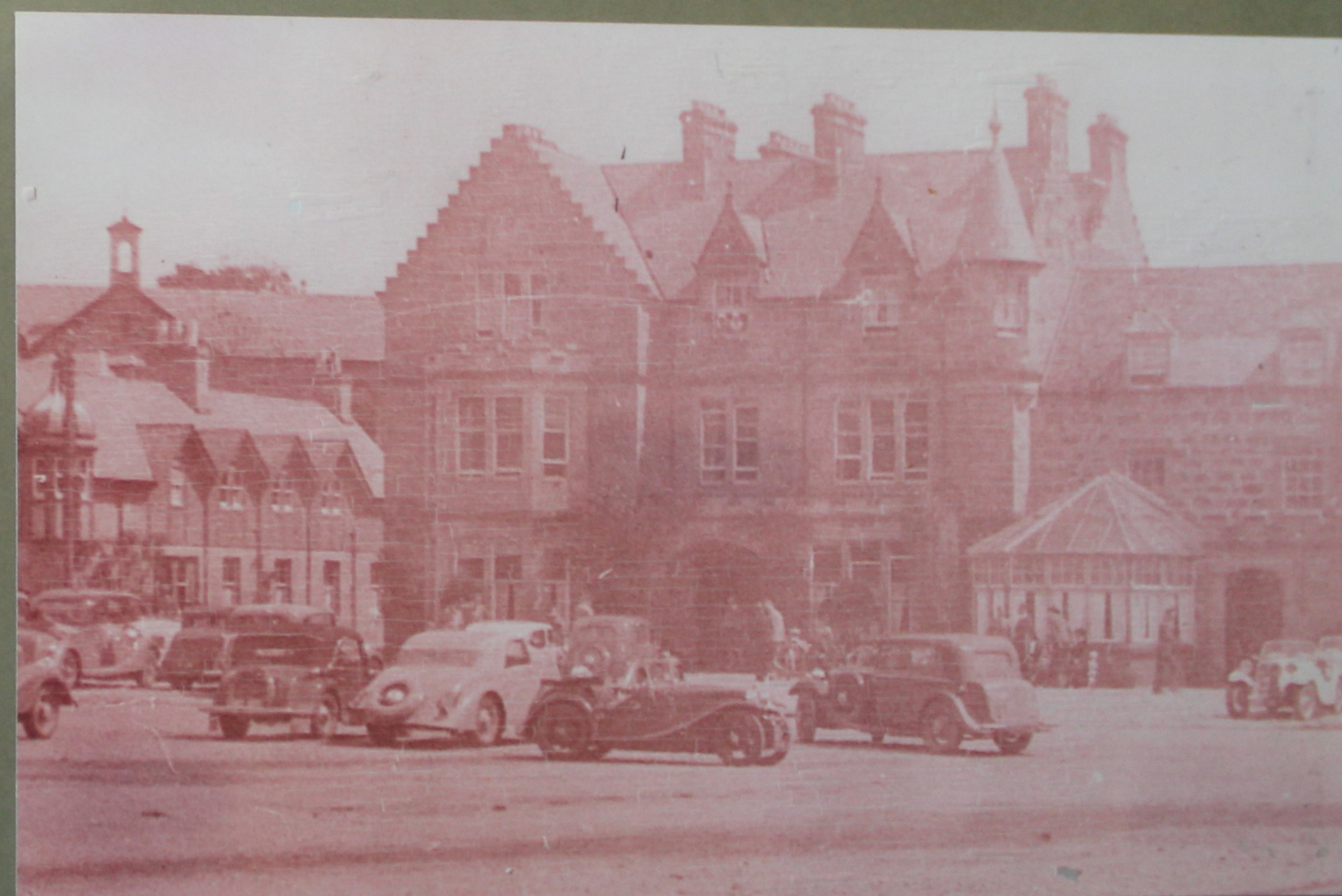
SUTHERLAND ARMS CAR RALLY 1930'S