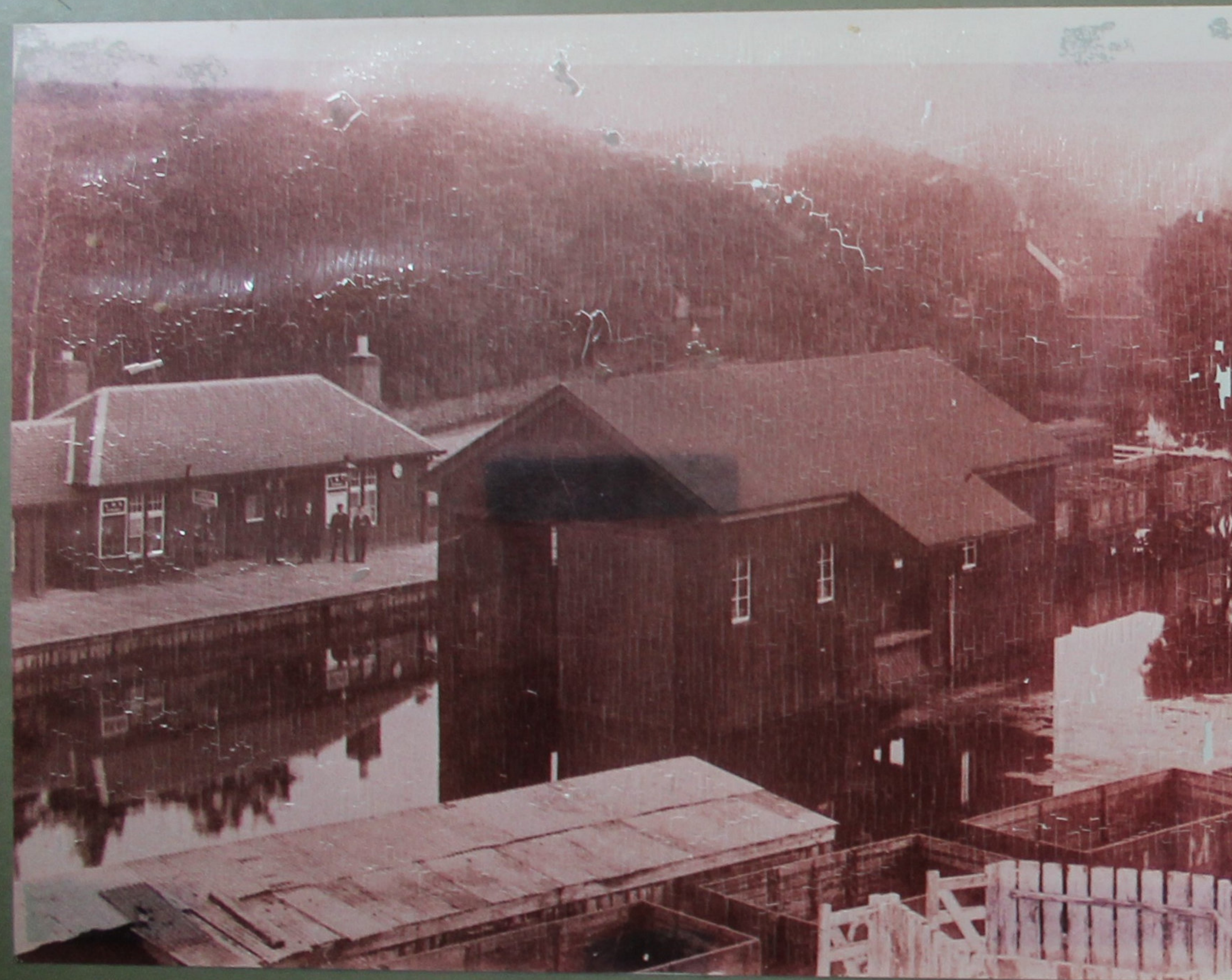
DORNOCH STATION FLOODED 1928-29