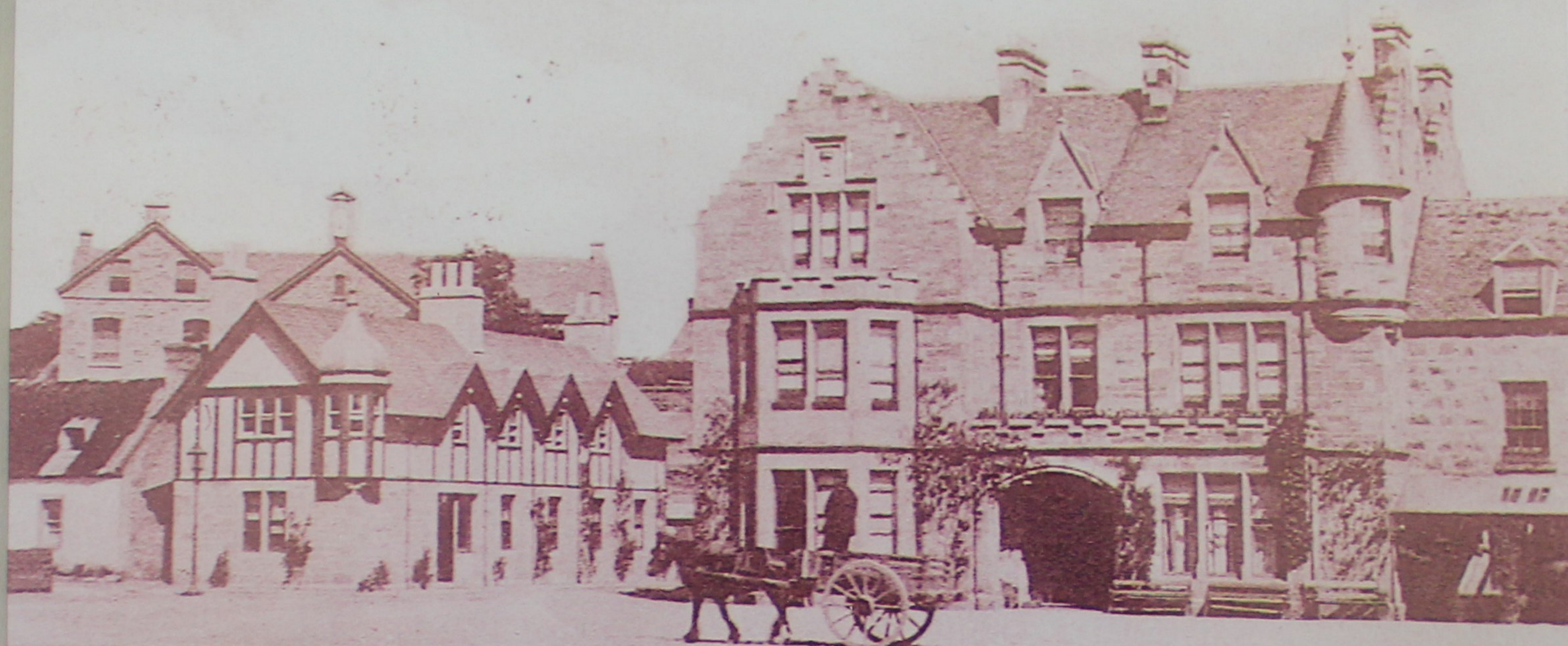
SUTHERLAND ARMS HOTEL, DORNOCH