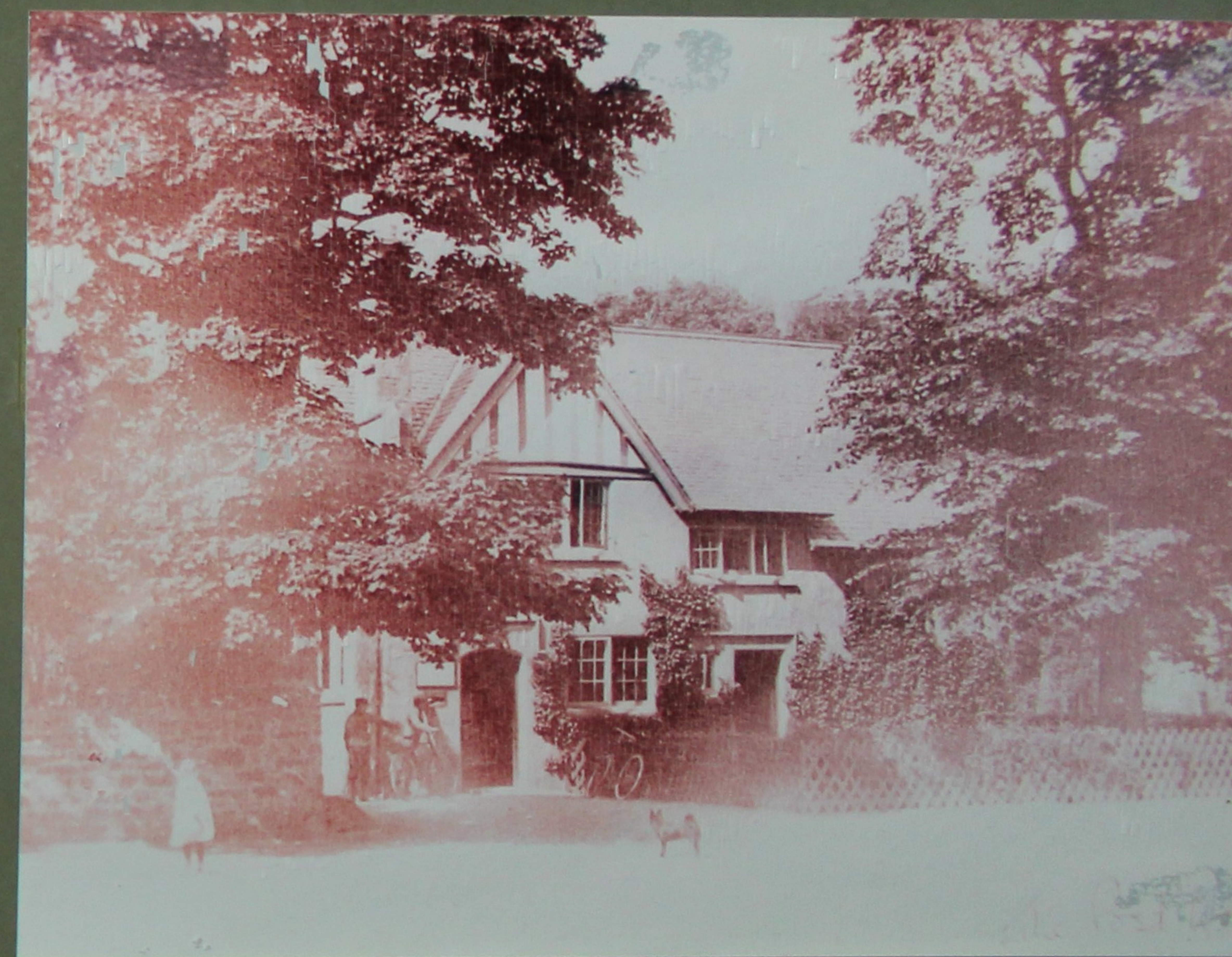
THE OLD POST OFFICE