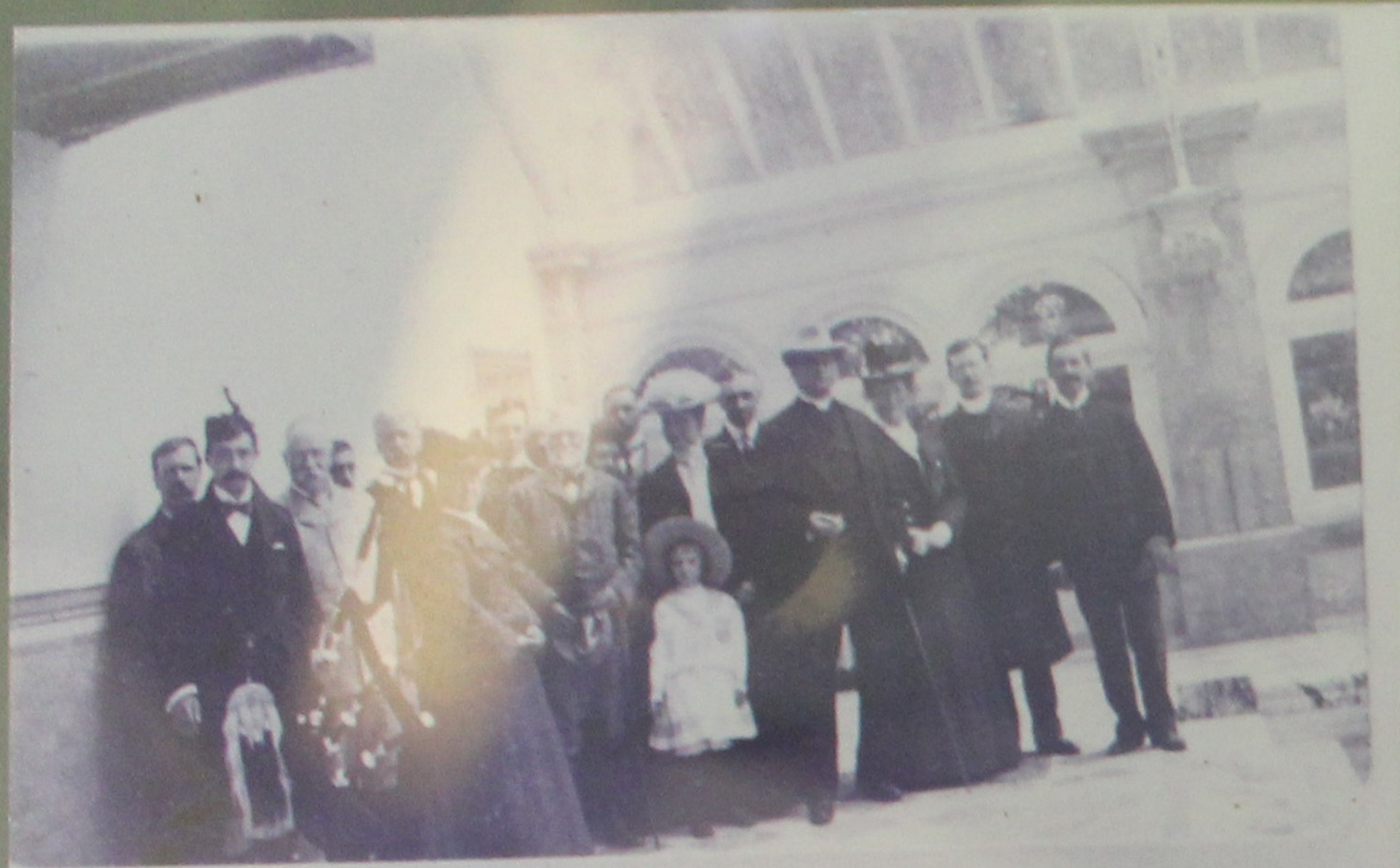
Opening of the swimming pool July 9th 1902.