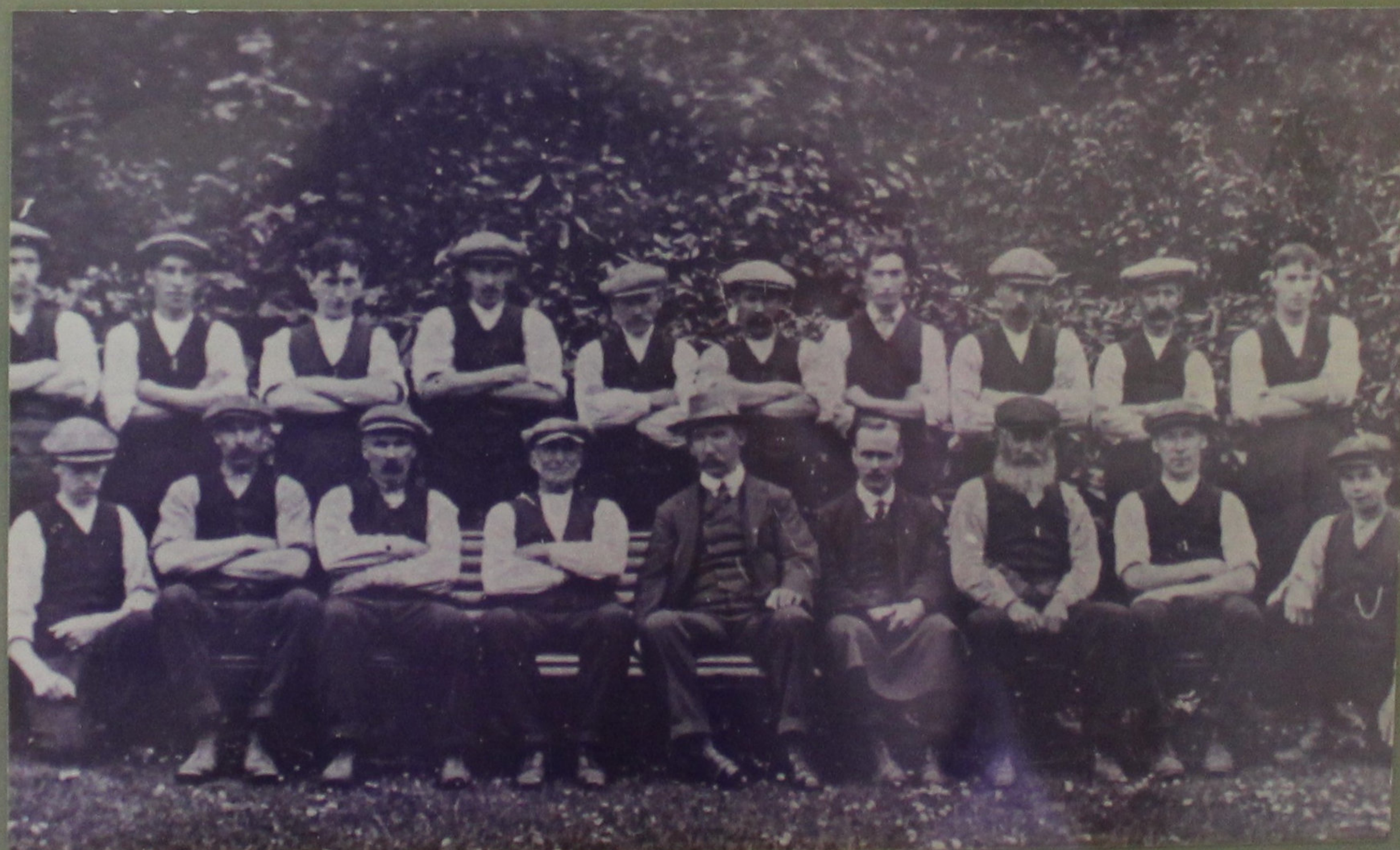
SKIBO HOME FARM STAFF 1914