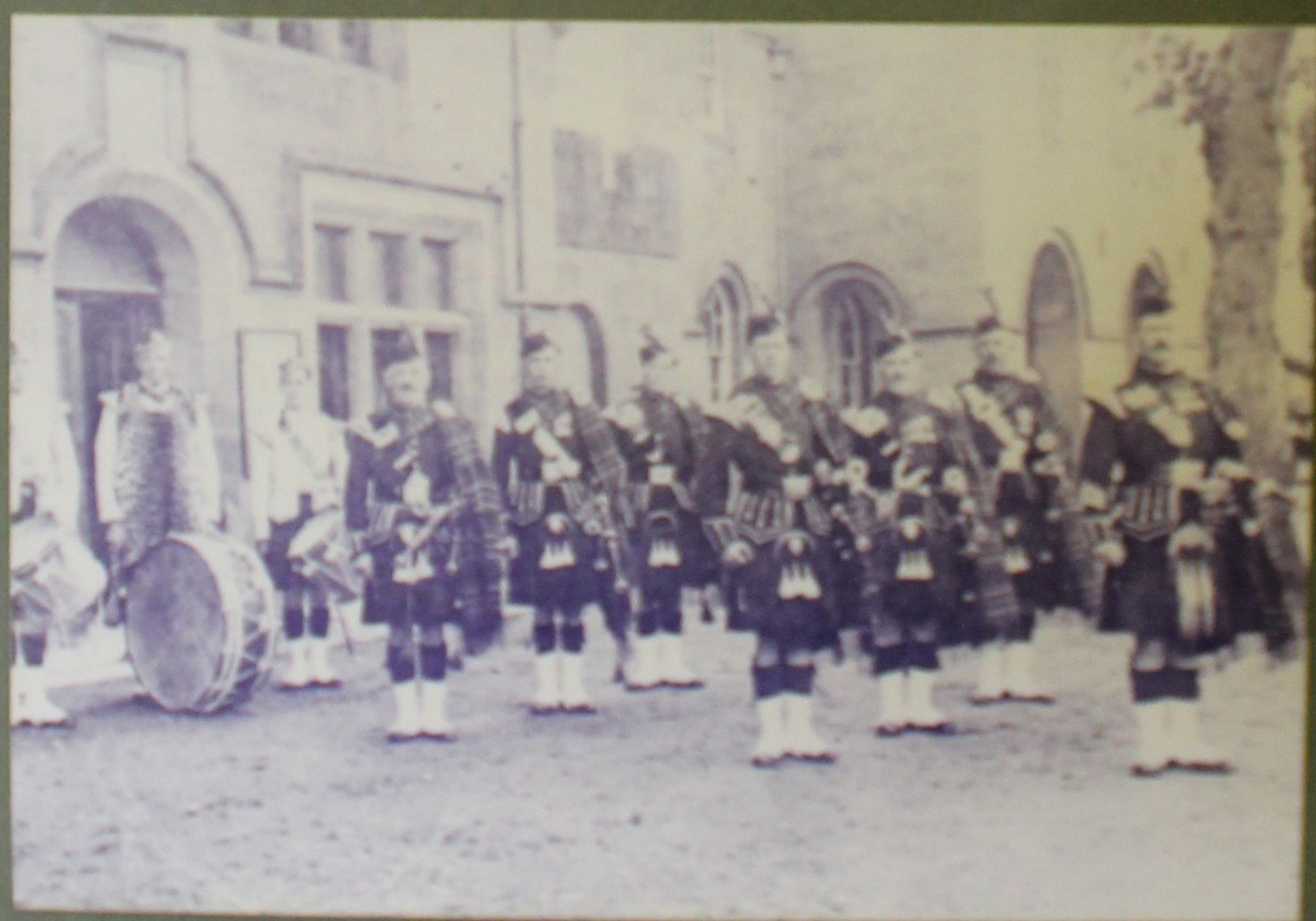
DORNOCH PIPE BAND 1930