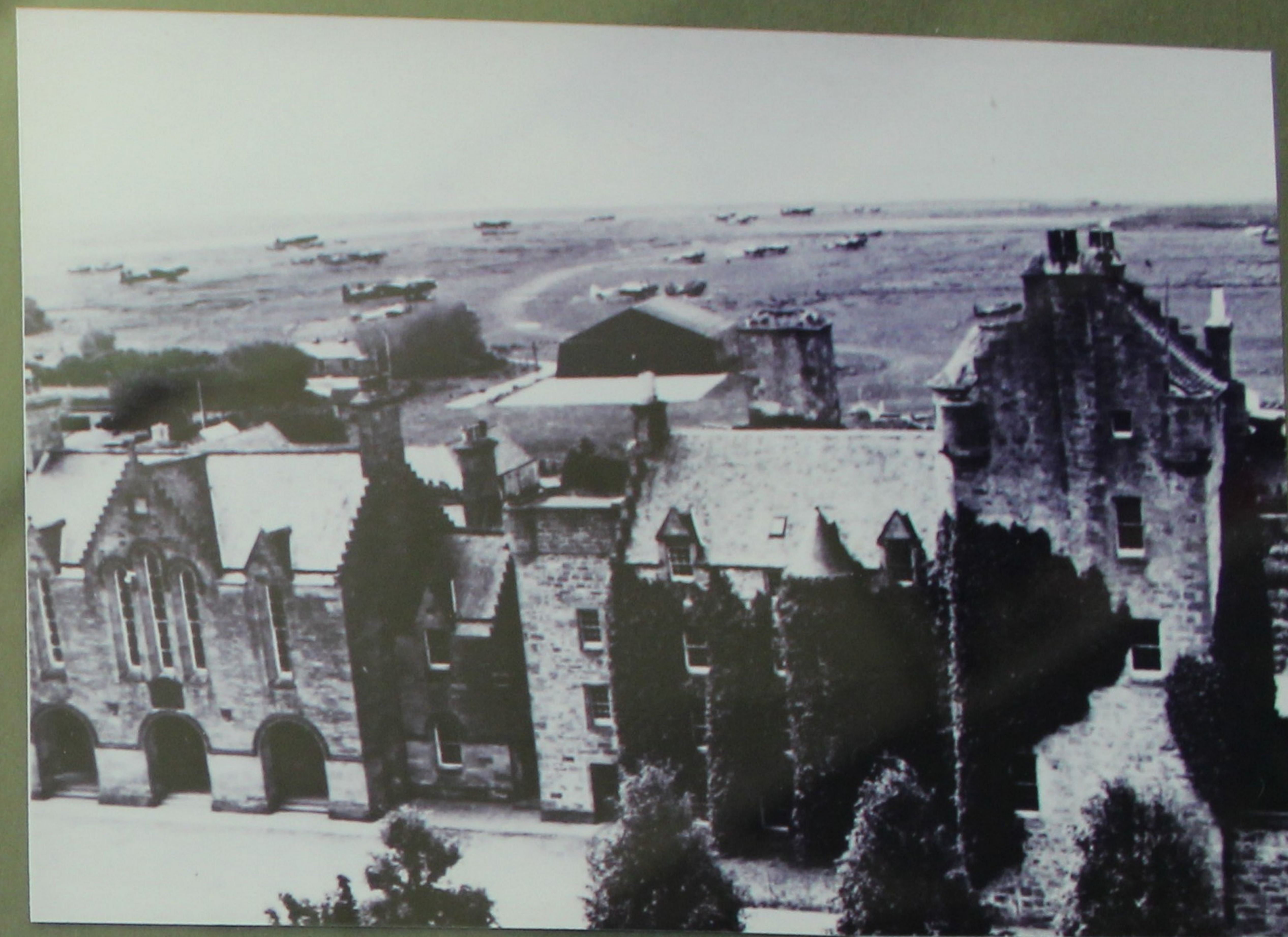
DORNOCH 2 ND WORLD WAR