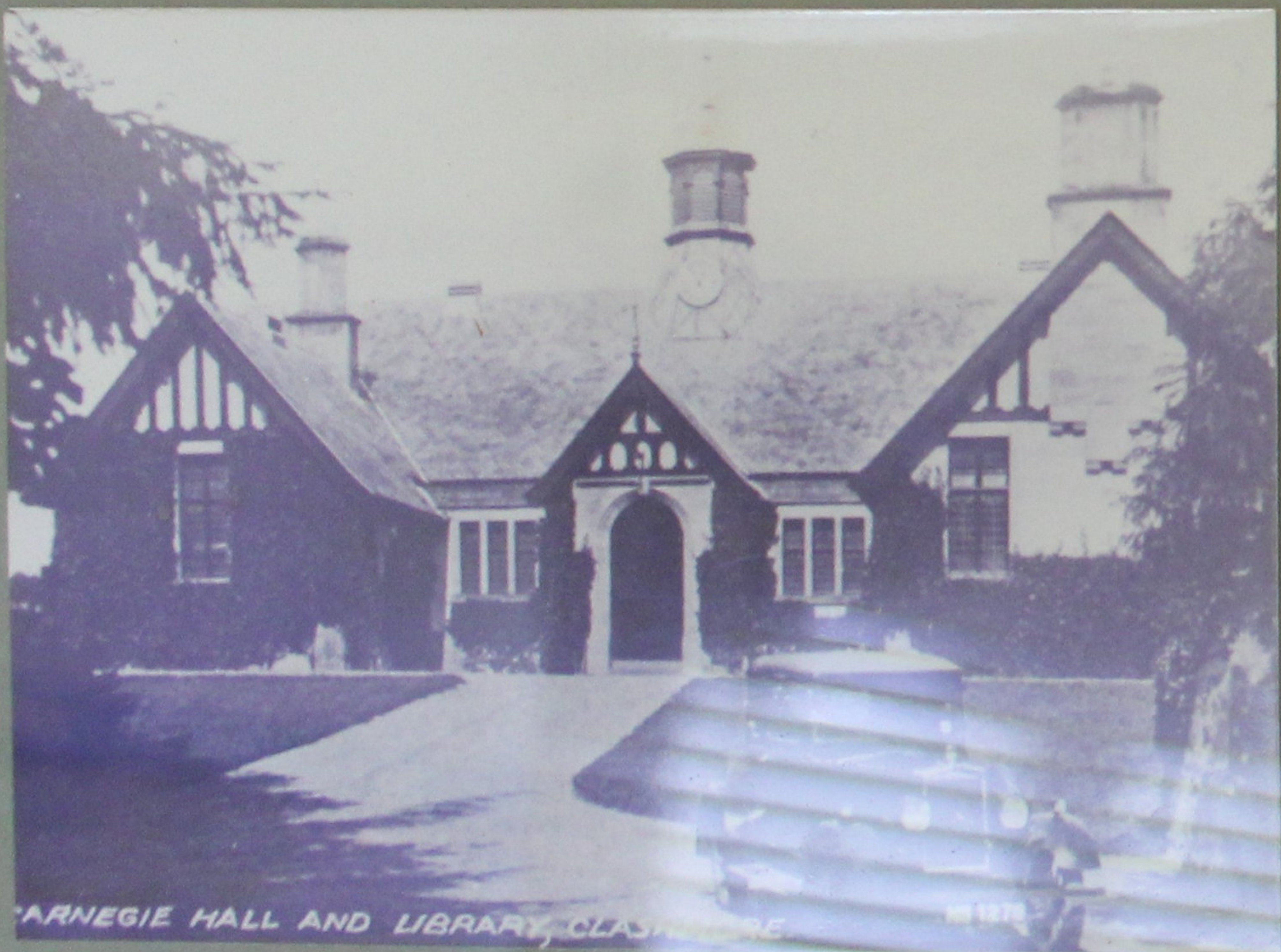
CARNEGIE HALL AND LIBRARY, CLASHMORE