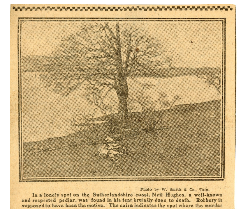
Newspaper unknown 27/03/1909