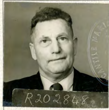
Photograph of Holder

Serial No. 80099A National Insurance No. AR 57 65 18 C Union or Society No. NUS - 576518