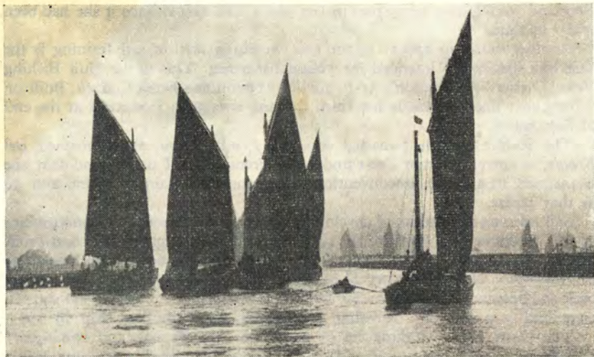
Scottish two-masted "Zulus" (luggers) leaving Great Yarmouth pre-1914