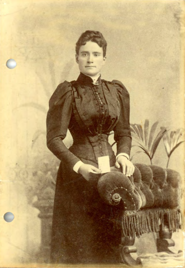
ABERDEEN. Mac Mahon STRATHPEFFER. INVERNESS