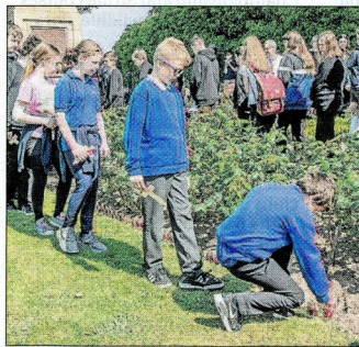
Pupils planted 100 crosses.