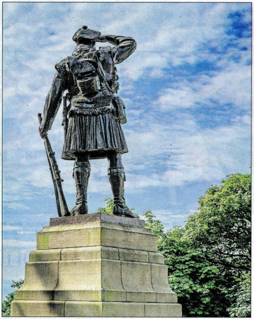
A short history of the monument was given by members of the Young Curators Club at Dornoch museum Historylink.