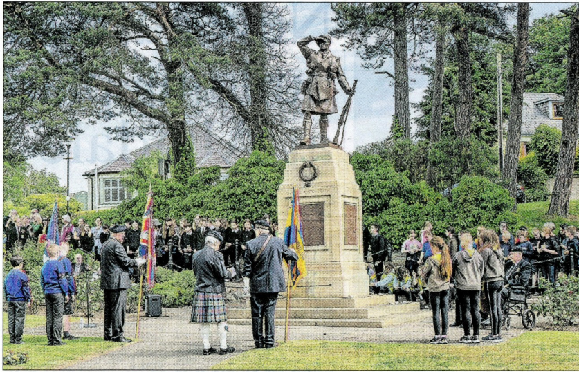
Dornoch remembered the Fallen at a ceremony to mark the centenary of the town's war memorial.