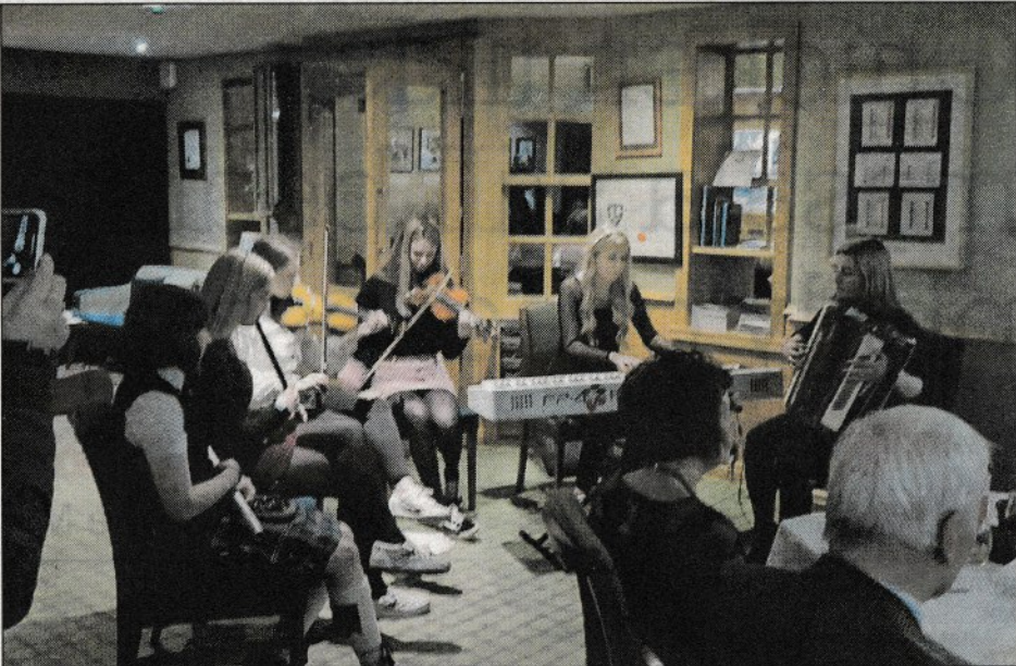
Members of Golspie High School's Interact Club entertain Rotarians.