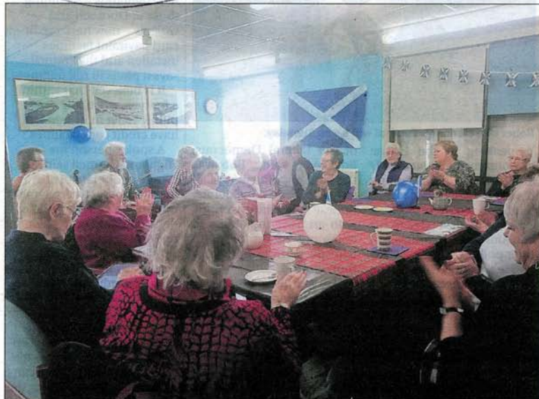
Helmsdale Hub's Burns meal was prepared by the Dinner to Your Door service.