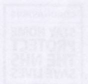
Nicola Sturgeon First Minister of Scotland