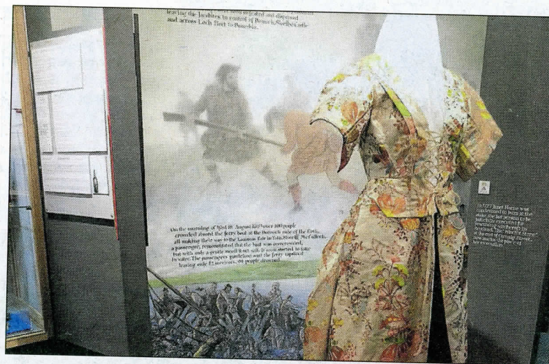
Staff at Historylinks Museum in Dornoch were thrilled to be shown the exquisite 300-year-old dress.

family have had their pictures taken wearing the dress on their 16th birthdays