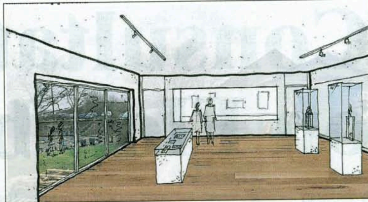
Plans include a bright, open interior.

produced by local architect Catriona Hill. These will be on display within the museum over an Open Weekend to be held tomorrow and Sunday when admission will be free.