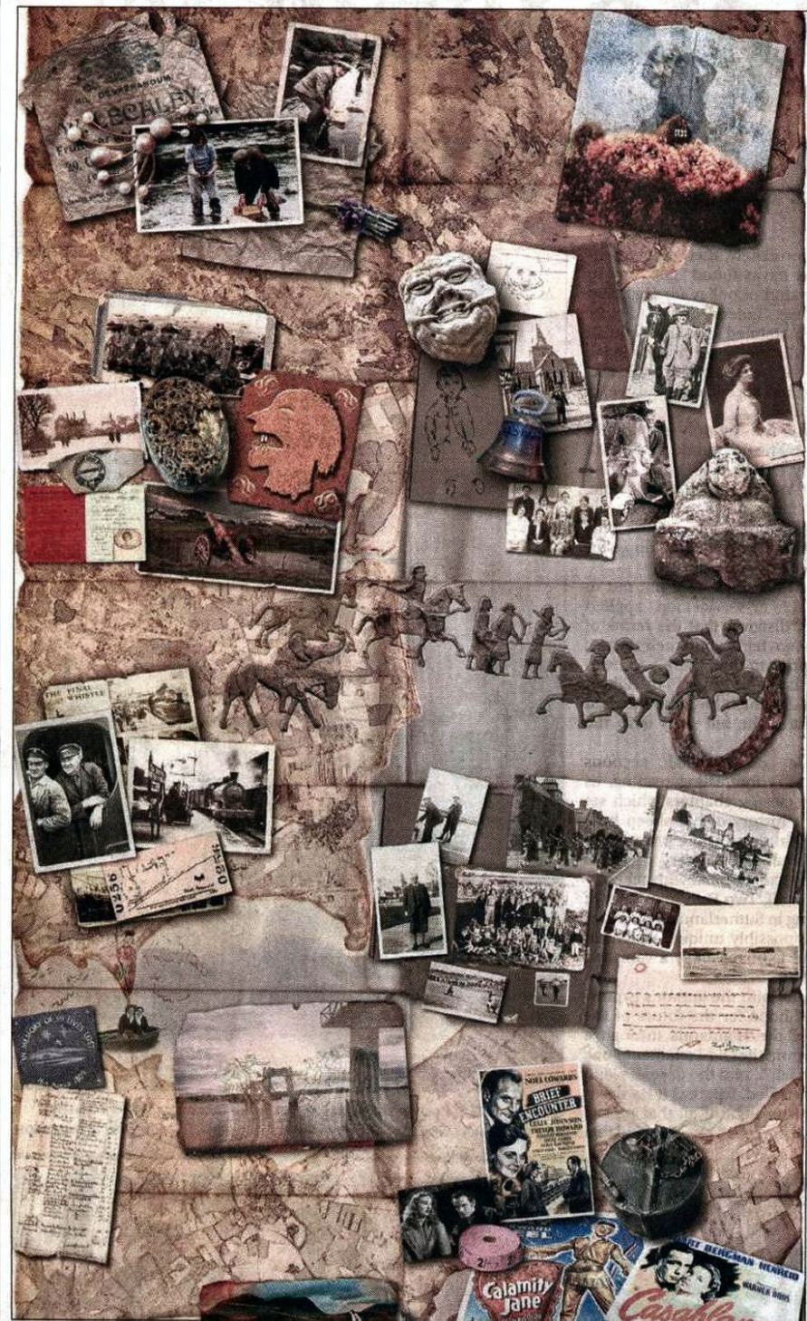
The Dornoch storymap has been hanging at Oversteps Eventide home but will soon be on display at the town's museum, Historylinks.