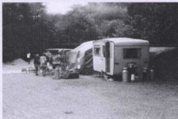
The Summer Walkers