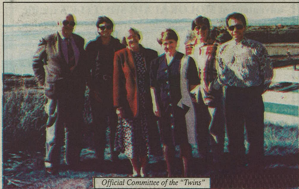
Official Committee of the "Twins"

A tall order to be sure - especially given that Embo is in the process of planning another insurrection - a 10th Anniversary of their first successful uprising. Just maybe this time around, someone from The Friendly Isle can cover it - how about it Ambassadors?