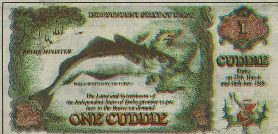
Currency - "One Cuddie" = a Free Whiskey (Clynelish, of course) with donation to the fund-raiser

THE DAY was July 16, 1988 and will live in infamy. To ensure that Embo's nationhood had all the trappings of the real things, instigators (also known as "activists") went to great lengths to be the real thing - a country. From "Independent State" currency, entry documents, their own flag, national anthem, and Parliament Buildings (the local pub and the Clynelish Distillery), to taxes - Embo had it. It should be noted that those alien visitors